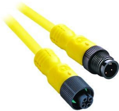
4-pin DC Micro Cordset